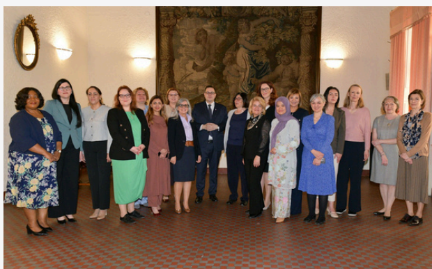
Ambassador Mlinarević at the meeting with the Minister of Foreign Affairs of Czech Republic