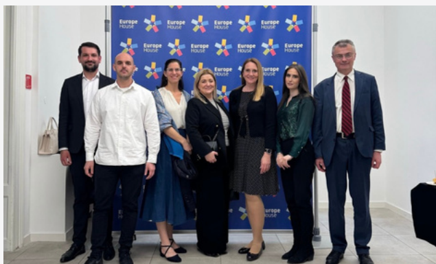
MFA Team at the WEDIN Speed Mentoring Event

Each mentoring session lasted just three minutes, creating a dynamic and engaging environment filled with insightful exchanges. Representatives of the Young Diplomats Club actively participated as mentees, seizing the opportunity to gain valuable guidance from seasoned professionals. The event fostered intergenerational dialogue, encouraged knowledge sharing, and inspired the next generation of diplomatic leaders.