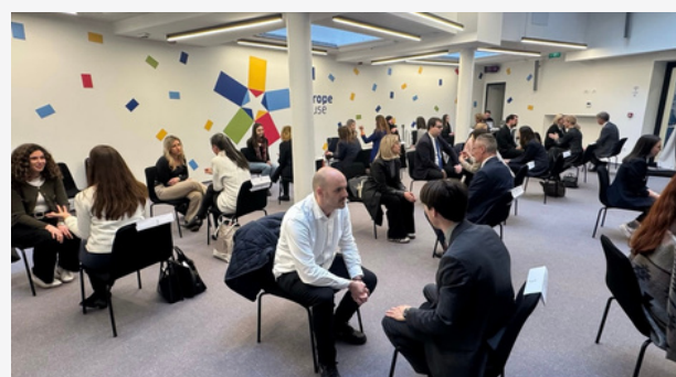
WEDIN Speed Mentoring Event at the Europe House