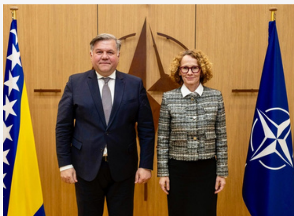
Deputy Foreign Minister Brkić with NATO Deputy Secretary General Radmila Shekerinska