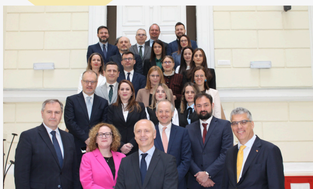
Meeting of WB6 MFA Network