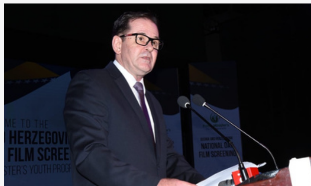
Embassy organized the films screening

As part of the public diplomacy program, the Embassy of Bosnia and Herzegovina in Islamabad, in cooperation with the Office of the Prime Minister of the Republic of Pakistan Shahbaz Sharif, presented a retrospective of films by one of the most prominent and influential directors from Bosnia and Herzegovina, Jasmila Žbanić at the Pakistan National Council of the Arts.