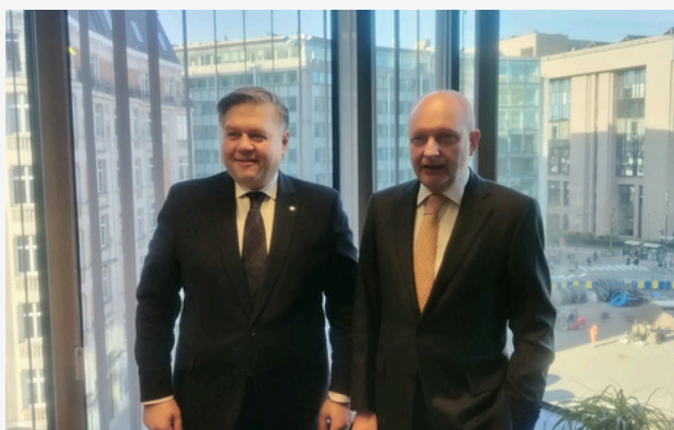
Deputy MFA and Managing Director of EEAS