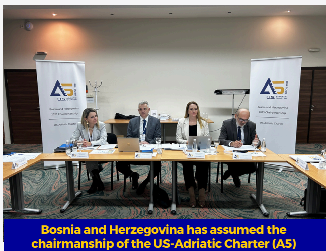
Bosnia and Herzegovina has assumed the chairmanship of the US-Adriatic Charter (A5)

The chairmanship was officially inaugurated with a meeting of the Directors for Foreign Affairs and Defense Policy under the theme "Common Approach to Crisis Management and Strengthening Resilience," held on April 16, 2025, at the Garden City Hotel in Konjic.