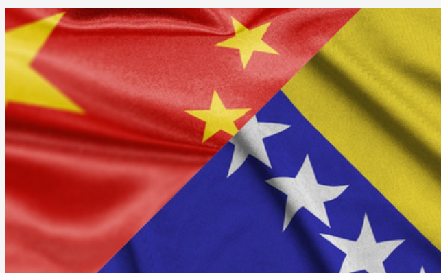
Bosnia and Herzegovina- People's Republic of China