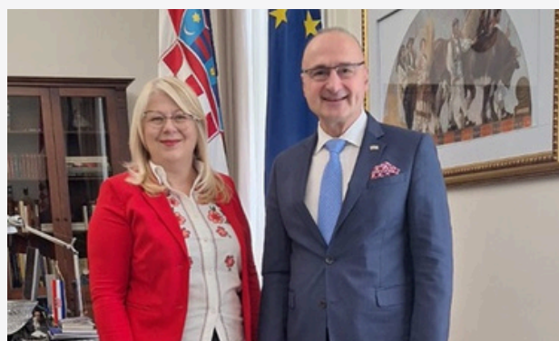
Ambassador Kovačević-Bajtal meeting with the Minister of Foreign and European Affairs of the Republic of Croatia