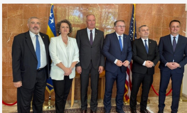
Delegation at the Embassy of Bosnia and Herzegovina in Washington, D.C.