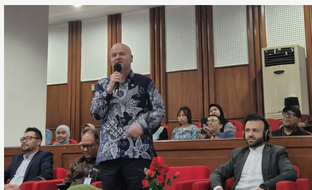
Ambassador had an opportunity to address the audience at the Ceremony

"Fostering unity in diversity." On behalf of the diplomatic corps, the ambassador of Bosnia and Herzegovina highlighted the importance of the well-known national slogan "Unity in diversity", which best describes the character, coexistence and tolerance of Indonesian society. He also emphasized the diversity of BiH society and the similarity with Indonesia in this regard.