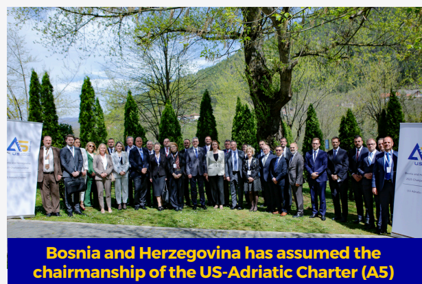
Bosnia and Herzegovina has assumed the chairmanship of the US-Adriatic Charter (A5)

Bosnia and Herzegovina took over the chairmanship of the A5 Charter, which serves as a strategic partnership aimed at fostering good neighbourly relations, reinforcing regional security and stability, and promoting democratic values and Euro-Atlantic aspirations among the countries of the Western Balkans. During its chairmanship in 2025, Bosnia and Herzegovina will be focusing on a unified approach to crisis management and enhancing regional resilience while prioritizing the improvement of mutual cooperation, the analysis of challenges, threats, and risks, with the goal of maximizing potential and achieving set objectives.