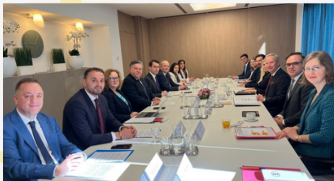
Meeting of MFAs of WB