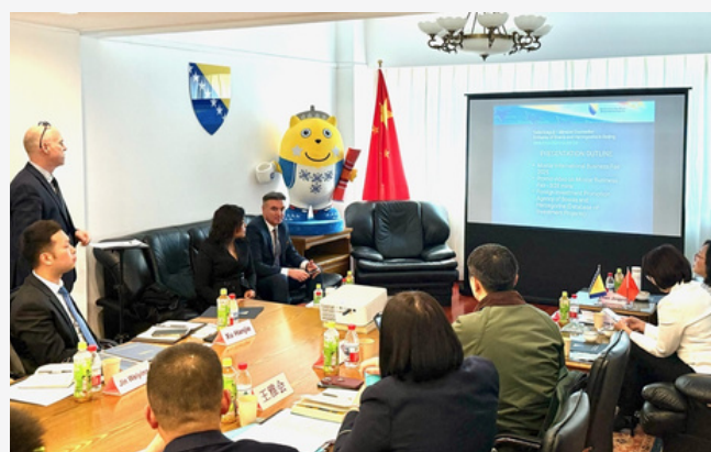
Conference for the Promotion of Investment Projects in Bosnia and Herzegovina