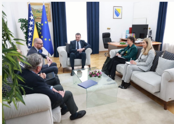
Minister Konaković with members of AFET

Minister Konaković, met with the members of the European Parliament's Committee on Foreign Affairs (AFET), namely Ondřej Kolář, the Rapporteur for BiH, Tineke Strik, and António Tânger Corrêa. Minister Konaković emphasized the importance of EU support for peace, stability, and security, both in Bosnia and Herzegovina and in the region, but also emphasized the role and activities of the EUFOR Althea mission.