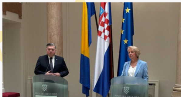
Deputy Minister Brkić at the meeting

policy positions with the Common Foreign and Security Policy of the European Union. The Deputy Minister also held a meeting with State Secretary Andreja Metelko-Zgombić, during which they discussed the dynamics of adopting the reforms set by the European Council, and the significance that each of these steps bring Bosnia and Herzegovina closer to adopting the negotiating framework opening the negotiations.