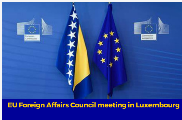
EU Foreign Affairs Council meeting in Luxembourg