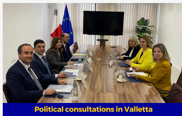
Political consultations in Valletta